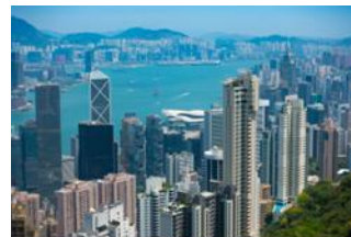
Hong Kong Asia Pacific Region

Our organisation boasts over 122,000 UK and international members.